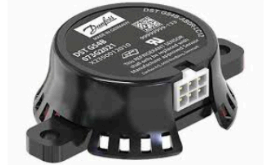
Refrigerant Detection System

Refrigerants in the A2L class are considered “mildly flammable” but no more dangerous than many other household products. An A2L refrigerant is safe when handled properly and when best practices and safety guidelines are applied. As part of the HVAC industry transition, Low Global Warming Potential (GWP) systems, which utilize A2L refrigerants, require sensors and safety protocol in the event of a leak. Allied Air products have additional safety features such as a Refrigerant Detection System that will reduce its concentration in the event of a leak occurring.